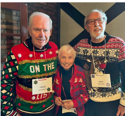
Holiday sweaters were out in full force!