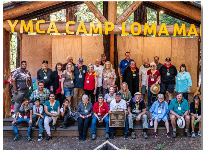
Staff from the late 60's and early 70's gathered for a reunion and dedication of the campfire bowl

The organizing and philanthropic contributions of returning former YMCA Directors have left an indelible mark on the experiences of the children and young adults who seek solace and growth within the embrace of Camp Loma Mar. This invaluable investment has paved the way for significant facility improvements that will enrich the lives of our campers, fostering even more memorable and life-changing moments.