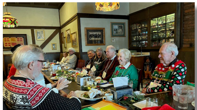
Lunch was great and the bavarian decor inviting.