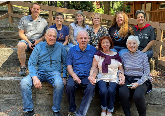
Donors, Family and Friends gather for the dedication of Cabins.