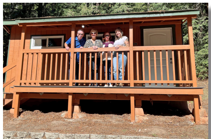
Donors enjoyed the view from one of the newly renovated cabins